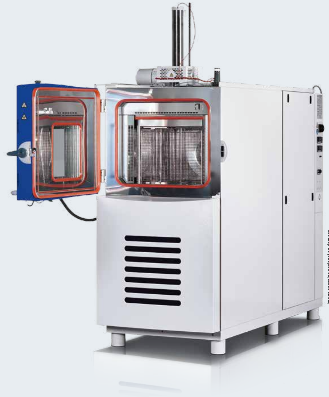
Image contains optional equipment

No need to worry about loss or excess of temperature: Test-chamber and test-object protection and test object shutdown are installed as standard. The test chamber itself is designed for operation at ambient temperatures of up to +35 °C, complying with the current VDE regulations and satisfying the EMV, low voltage and machine directives.